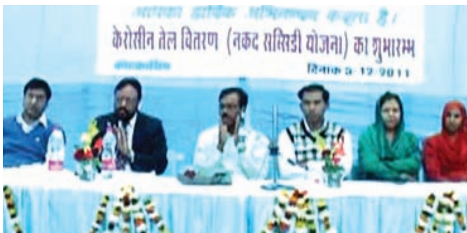
Inauguration of Kerosene Cash Subsidy Scheme

- It is an e-Governance initiative of Rajasthan Government for effective, accountable and transparent Public Finance Management. IFMS has been